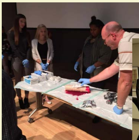
Stop The Bleed Training