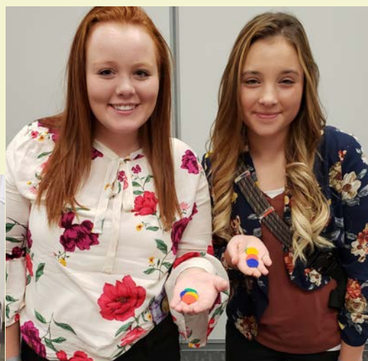
The Shape of Change Leadership Game